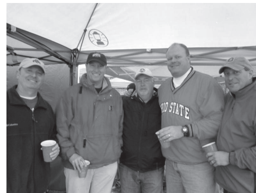
The mission of the Central Ohio Alumni Association is to provide opportunities for you to stay connected with fellow Phi Deltas, like through our annual Homecoming tailgate. This year's event was held October 19th when the Buckeyes took on the Iowa Hawkeyes.

As we close out the fall semester and approach the holiday season, I look forward to connecting with you as you renew your ties to our brotherhood this year. I am counting on you to join the momentum from last year and make a gift in 2013-14 (see page 2 for instructions). Also, please re-engage with our alumni relations program this year. Check out our new web site, make sure your email address is on file to stay up to date on the latest news and event information, and make plans to join us for the next Phi Delt Open next summer.