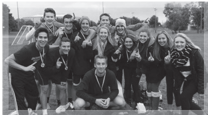
Ohio Zeta won this fall's annual Just for Kicks soccer tournament hosted by Tri Delta.

As you read on page 1, the chapter conducted its Second Annual Memorial