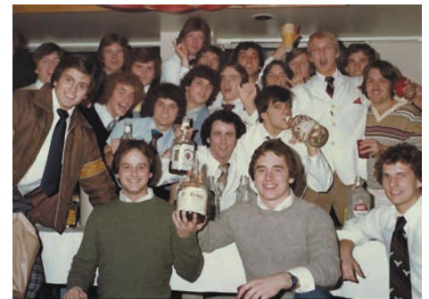
Valentine's Day Dance '79